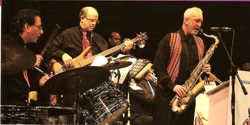
Full Count Big Band performing at the Van Fossan Theatre.